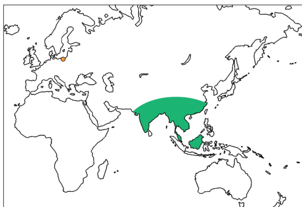
Fig. 8. Known distribution of the extant species of Platypelochares (green) and the location of the amber deposit (orange).

absent from Europe (ca 60%, ALEKSEEV 2017). Of these, ten genera have a Palearctic-Oriental distribution, and only three are currently exclusively found in the Oriental Region ( Balistica Motschulsky, 1861, Eucnemidae; Japanopsimus Matsushita, 1935, Cerambycidae; Anisodera Chevrolat, 1836, Chrysomelidae; ALEKSEEV 2017). The pattern displayed by Platypelochares (Fig. 8), although rare (three out of 299), is thus not unique, and can most likely be explained by the climatic conditions in north-central Europe during the late Eocene, which was much warmer and more humid than at present (ZACHOS et al. 2001, ALEKSEEV 2017). The so called “Baltic amber forests” were a very diverse ecosystem spreading over a vast area of Northern Europe during the Eocene (WOLFE et al. 2009, SZWEDO 2012). There are still many open questions about the structure of amber forests (ERICHSON & WEITSCHAT 2008, WEITSCHAT & WICHARD 2010), as modern representatives of arthropods found as amber inclusions live in a wide variety of habitats, from dry to wet or lowland to montane (GRÖHN 2015). Some extant species of Platypelochares are known to be good fliers, frequently collected in light traps, and their precise microhabitat is poorly known (HERNANDO & RIBERA 1999).