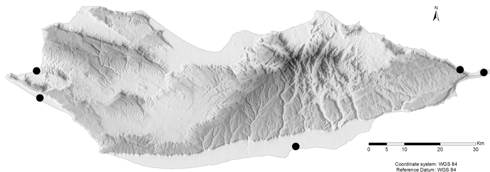
Fig. 6. Sketch map of the Socotra Island with known distribution of Stomanomala subcostata (Fairmaire, 1887).