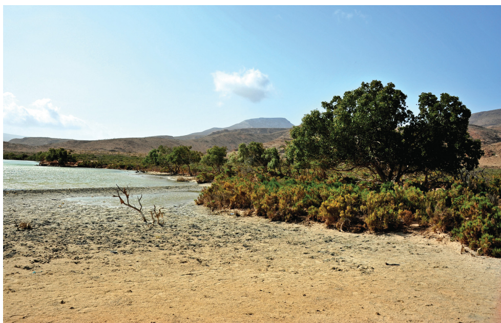
Fig. 7. Coastal sandy area near Shuab, Socotra, April 2012, habitat of Stomanomala subcostata (Fairmaire, 1887).