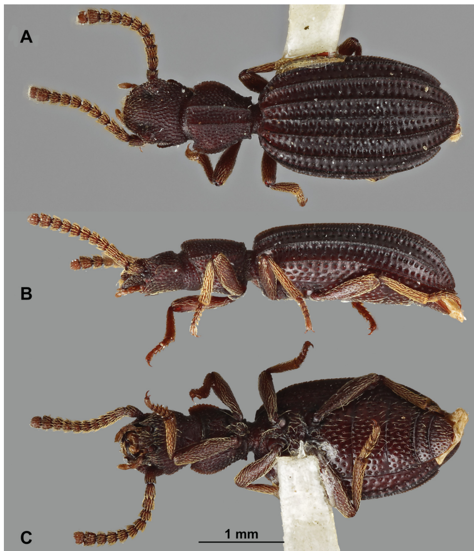
Fig. 1. Renefouqueosis peruvienensis gen. et sp. nov., habitus female. Dorsal (A) lateral (B) and ventral (C) views.

Comparative diagnosis. Renefouqueosis gen. nov. (Stenosini: Stenosina) can be distinguished from all other genera of New World Stenosini (subtribe Stenosina) by the following characters: (1) the antennomeres are completely separated ( Ecnomoderes Gebien, 1928 as well as Grammicus Waterhouse, 1845, which also occurs in Southern Peru has the antennomere XI embedded in the X apically); (2) pronotum with coarsely serrate lateral margins and (3) the presence of two keels on the central aspect of the