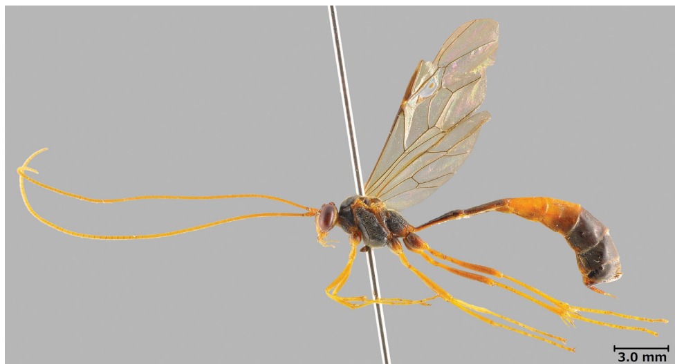
Fig. 1. Lateral habitus of Enicospilus kikuchii sp. nov. (holotype).

Differential diagnosis. Within the E. antefurcalis species-group, this new species closely resembles E. melanocarpus in morphology, although distinct in colour, but they can be distinguished from each other by the following combination of characteristics: mesosoma, T1, T2, and T5–8 dark-brown to black in E. kikuchii , but usually most of body yellowish brown and T5–8 usually blackish in E. melanocarpus ; and metapleuron roughly diagonally punctostri-gose in E. kikuchii , but uniformly punctate or finely diagonally punctostriate in E. melanocarpus . Enicospilus kikuchii also resembles E. combustus (Gravenhorst, 1829) and E. nigropectus Cameron, 1905, within the Palearctic Region, in its colour pattern. However, E. combustus and E. nigropectus do not belong to the E. antefurcalis species-group and are distinguishable