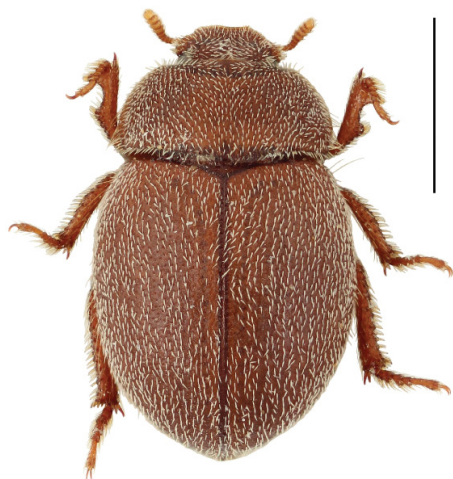
Fig. 18. Freyula psammarina psammarina Koch, 1959, habitus in dorsal view. Scale bar = 1 mm.

Material examined (21 spec.). YEMEN: SOCOTRA ISLAND: Noked plain, sand dunes, N 12°2'09" E 53°01'47", 11 m, 6.–7.xii.2003, 5 spec., D. Král leg. (NMPC); Halla area, Arher, freshwater spring in sand dune, N 12°33'00", E 54°27'36", 5 m, 9.–10. + 15.vi.2012, 11 spec., L. Purchart leg. (LPCB); same data, 5 spec., J. Hájek leg. (NMPC).