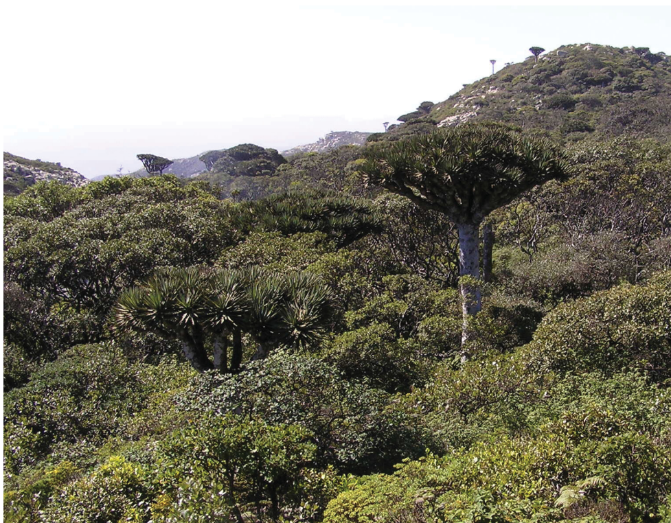
Fig. 4. Skand, the type locality of Anthrenus (Nathrenus) purcharti sp. nov.

Collection circumstances. The type series was collected in the highest mountain zone of the Socotra Island, the Skand Mt. (ca. 1300–1500 m a.s.l.), covered with evergreen woodland (alliance Crotonion sulcifructi , association Leucado haghierensi-Pittosporum viridiflorum ) (Fig. 4) (L. Purchart, pers. comm.).