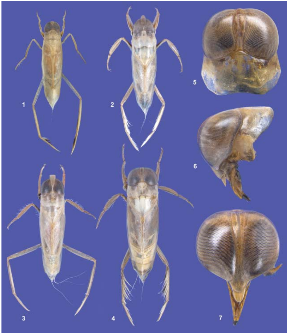
Figs. 1–7. Anisopinae. 1–4 – Habitus, dorsal aspect: 1 – Anisops breddini Kirkaldy, 1901, male; 2 – A. kuroiwa Matsumura, 1915, male; 3 – A. nasutus Fieber, 1851, male; 4 – A. occipitalis Breddin, 1905, male. 5–7 – Anisops occipitalis Breddin, 1905, male, head and pronotum, in dorsal (5), lateral (6) and frontal view (7).