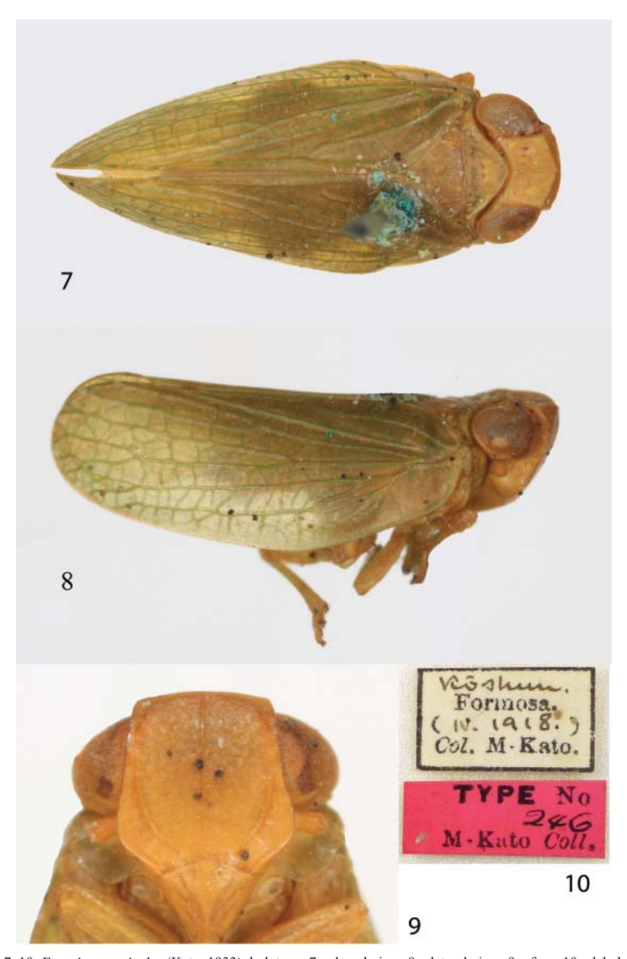
Figs 7–10. Eusarima versicolor (Kato, 1933), holotype. 7 – dorsal view; 8 – lateral view; 9 – face; 10 – labels.