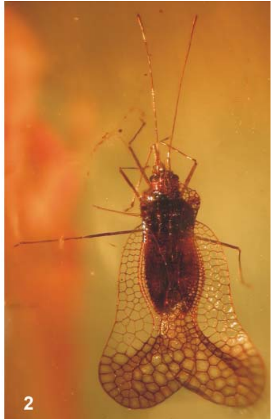
Figs. 1-2. Phymacysta stysi sp. nov. 1 – reconstruction of holotype; 2 – photography of amber inclusion. Scale bar: 1.0 mm.

Antennae very long (0.67 of body length measured from head apex to hemelytron apex) and very thin, especially segment 3; antennae almost nude, only segment 4 covered with short and scarce hairs. Areolate bucculae closed anteriorly, high and strongly projecting beyond clypeal apex. Rostrum moderately long, extended most probably to hind coxae (the holotype has rostrum turned backwards).